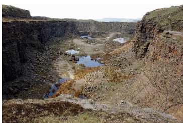
Lee Mill Quarry, Bacup one of the sites being considered

"The Adrenaline Village will give us an internationally renowned facility and will bring jobs and income. It will put East Lancashire on the map and let investors know that we are open for business. Only one project in the country will win this money and we all need to get behind this bid"