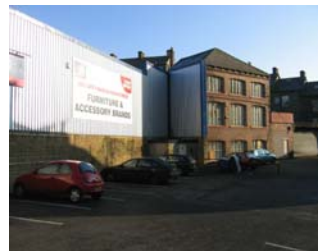
Proposed site at Novaks

"Right at this moment, in our poorest communities, there are people dreaming about doing something to improve their lot.