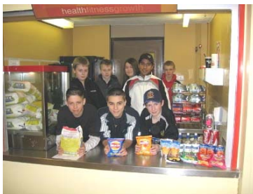
The Alchemy Club team at Alder Grange

For details of next event contact Clare Foster 01706 223171